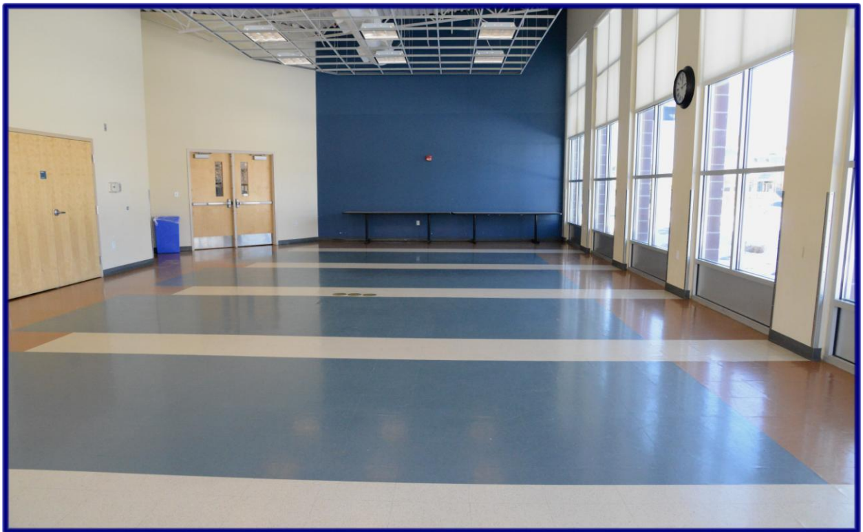
Conference Room 1,167 Square Feet 78 Capacity