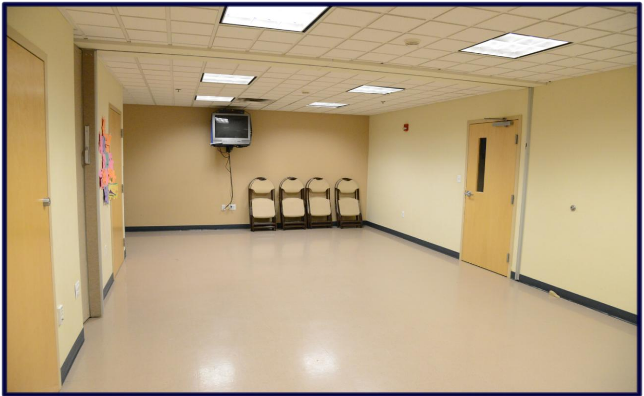
Meeting Rooms 504 Square Feet 34 Capacity